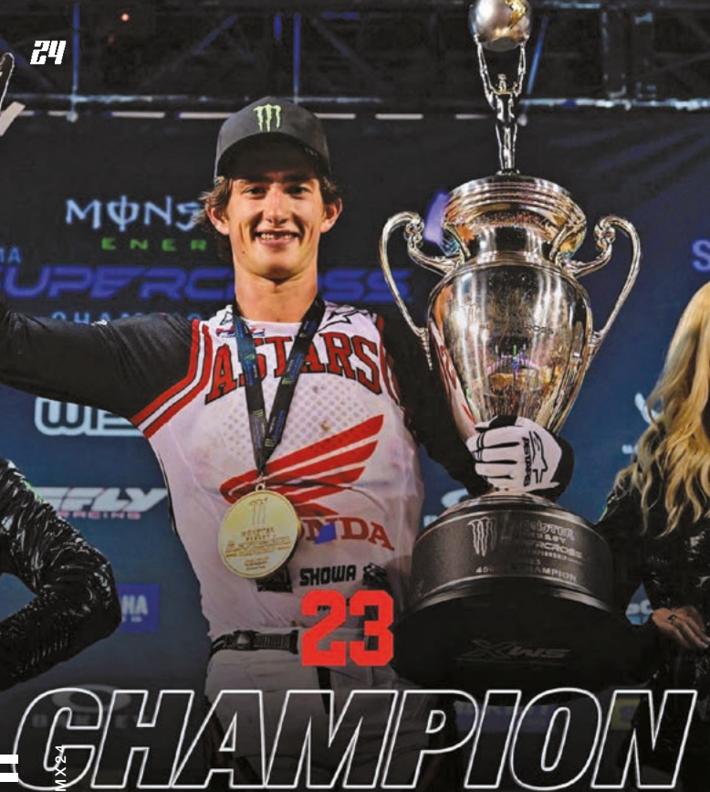
2023 450SX CHAMPIONSHIP