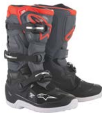
GRAY RED SZ 482-25902 2 482-25903 3 482-25904 4 482-25905 8 482-25906 5 482-25907 7 482-25908 8