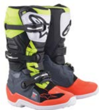
BLK COOL GREY YELLOW FLUO SZ 482-261502 2 482-261503 3 482-261504 4 482-261505 8 482-261506 5 482-261507 7 482-261508 8