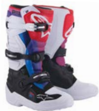
WHITE BLACK RAINBOW SZ 482-48502 2 482-48503 3 482-48504 4 482-48505 8 482-48506 5 482-48507 7 482-48508 8