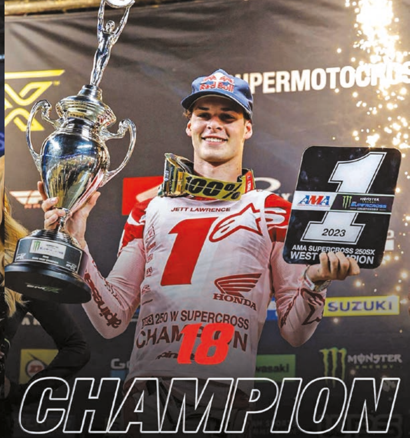
2023 250SX WEST CHAMPIONSHIP