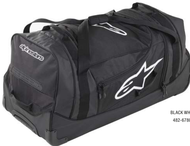
BLACK WHITE 482-67804