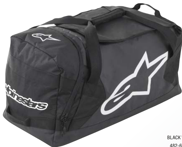
BLACK WHITE 482-67807