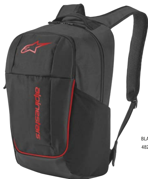
BLACK RED 482-76029