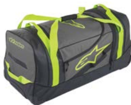
BLACK YELLOW FLUO 482-67805