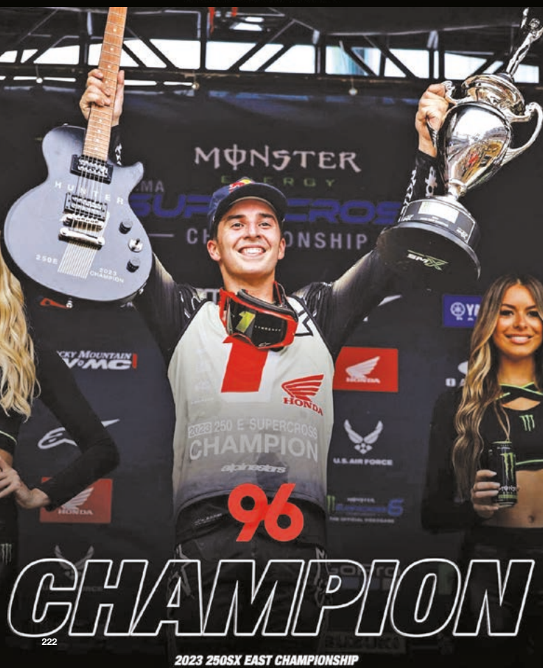
2023 250SX EAST CHAMPIONSHIP