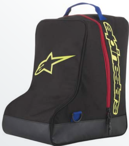
BLACK BLUE 482-67821