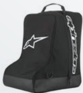
BLACK WHITE 482-67820