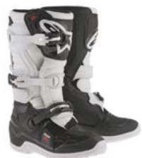
BLACK WHITE SZ 482-25202 2 482-25203 3 482-25204 4 482-25205 8 482-25206 5 482-25207 7 482-25208 8